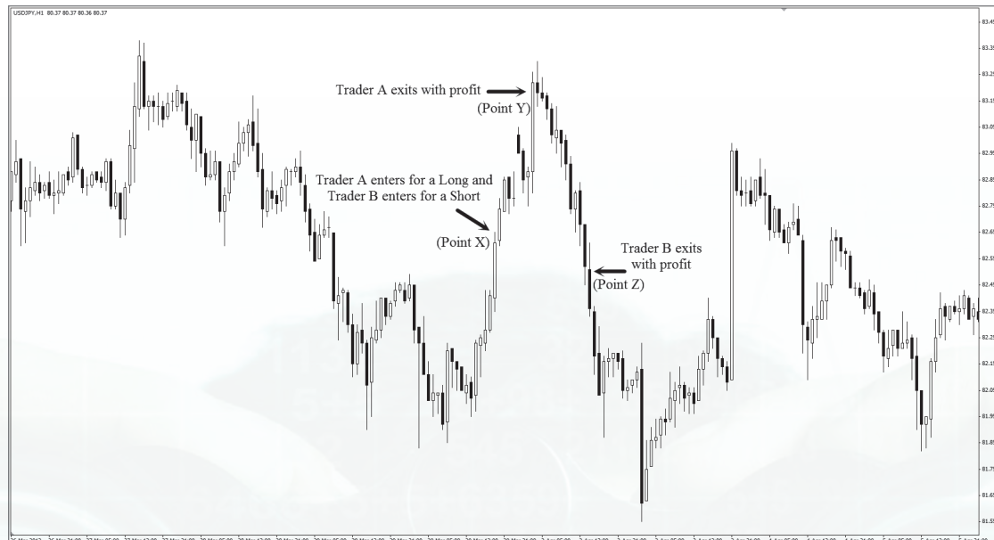
FIGURE 5.1 Traders Making Profit at Different Exit Prices